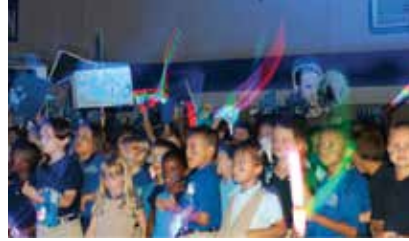
CPA students celebrate their PIS of 112.9 with an assembly